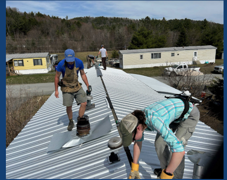
COVER Home Repair