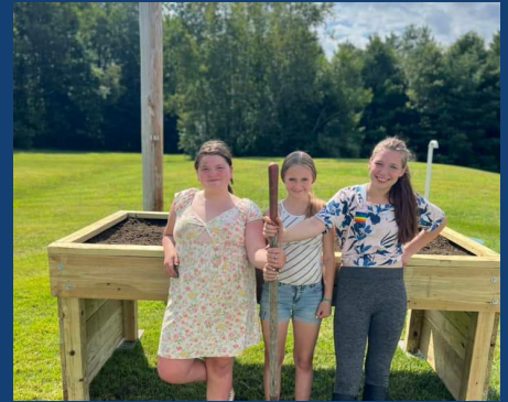
Girls Scout Troop 30261