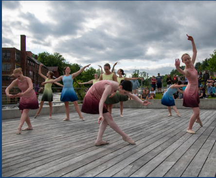
Avant Vermont Dance