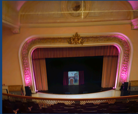
Claremont Opera House