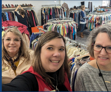
Turning Points Network