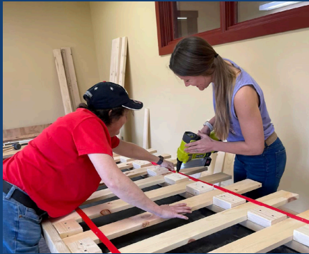
Sleep In Heavenly Peace