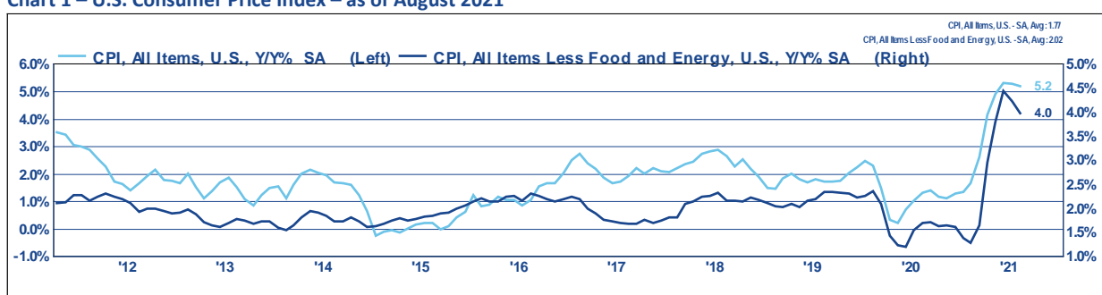
Chart 1 – U.S. Consumer Price Index – as of August 2021

More and more, both companies big and small, are raising prices to cover increasing input and wage costs. The August 2021 Small Business Optimism survey from the National Federation of Independent Business revealed that 49% of small businesses are passing on price increases which is the highest level since 1981. Consumer confidence surveys indicate consumers are becoming increasingly concerned about inflation and growing more cautious.