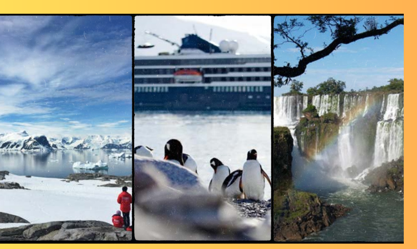
More to be announced at our Spring Kickoff Party!

An Antarctic Expedition Jan 5 or 7 to 21, 2025