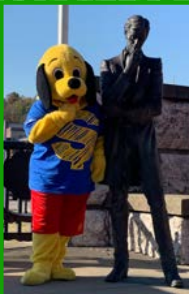
Above: Money Dog with President Abraham Lincoln Below: Money Dog hangs out with Stephen Douglas

Have you been to Lincoln-Douglas Square?