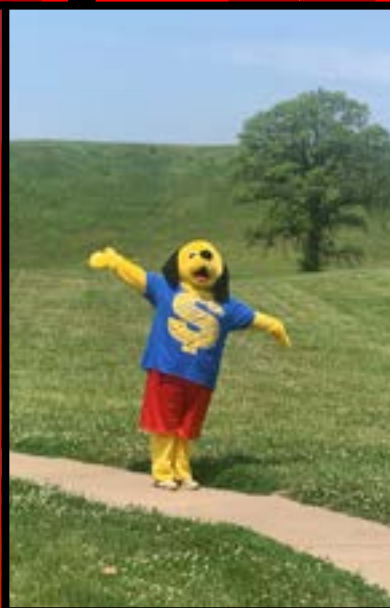
Money Dog at Monks Mound, the largest of the mounds at Cahokia Mounds.

Have you been to Cahokia Mounds with your family or on a field trip with school?