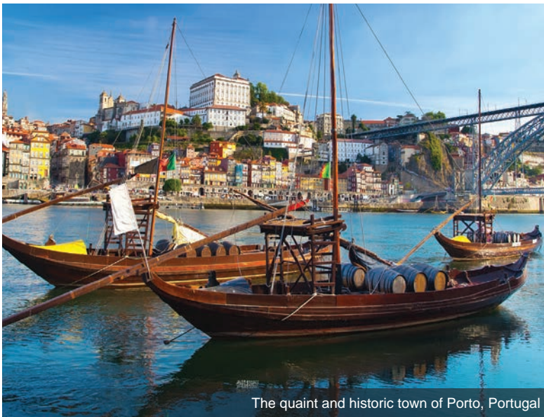
The quaint and historic town of Porto, Portugal

DAY 9 Régua – Lamego: From Régua, journey to the marvelous baroque village of Lamego, home to the Sanctuary of Our Lady of Remedies - one of the most important pilgrimage sites in Portugal. See the Sanctuary perched atop the hill, with its iconic 686-step granite staircase, decorated with the traditional Portuguese blue and white ‘azulejos’ tiles. Return to the ship in Régua after the excursion. Meals: B, L, D