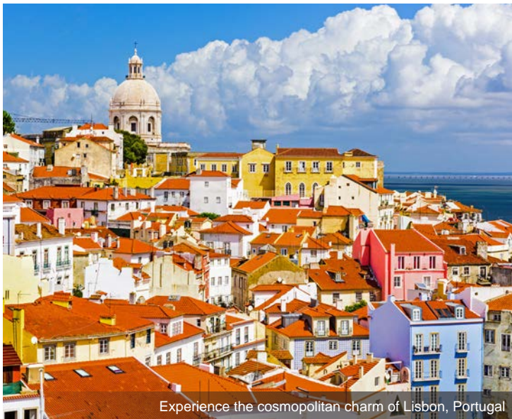
Experience the cosmopolitan charm of Lisbon, Portugal