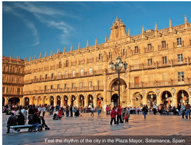
Feel the rhythm of the city in the Plaza Mayor, Salamanca, Spain

DAY 1 Depart the USA: Depart the USA on your overnight flight to Lisbon, Portugal.