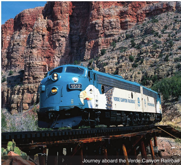
Journey aboard the Verde Canyon Railroad

DAY 5 Verde Canyon Railroad: This morning, stop in Jerome, an old mining town and melting pot for those who dreamed of making a quick fortune. Once virtually a ghost town, it is now restored with shops, museums and art. Later, climb aboard the Verde Canyon Railroad for a spectacular journey over old-fashioned trestles, past ancient Indian ruins and through a 700-foot tunnel. Enjoy the views from the comfort of your First Class seat or from one of the open-air viewing cars. Watch for wildflowers, blooming cacti and wildlife in their natural habitat. Tonight, chow down with a chuckwagon supper at the “Blazin’ M Ranch” and Western Stage Show. Meals: B, D