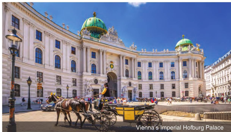
Vienna's Imperial Hofburg Palace

DAY 9 Bratislava, Slovakia: Today you sail into the capital of Slovakia. This graceful nation became an independent country in 1993, and since then, Bratislava has flourished as a new capital and made a name for itself as a cultural center. The romantic cobblestone lanes that weave through the city are explored with your local guide as you enjoy a walking tour of the ancient town center, seeing the Slovak National Theatre and a range of Gothic and Art Nouveau buildings. For the more active guests, embark on a guided hike to Bratislava Castle, a landmark steeped in legends that looks as though it came from the pages of a fairytale book. Meals: B, L, D EmeraldACTIVE: A guided hike to Bratislava Castle (instead of walking tour) DiscoverMORE: Skoda tour of post-Communist Bratislava (additional expense) EmeraldPLUS: Local Slovakian entertainment onboard