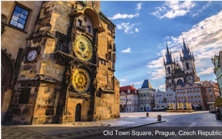
Old Town Square, Prague, Czech Republic