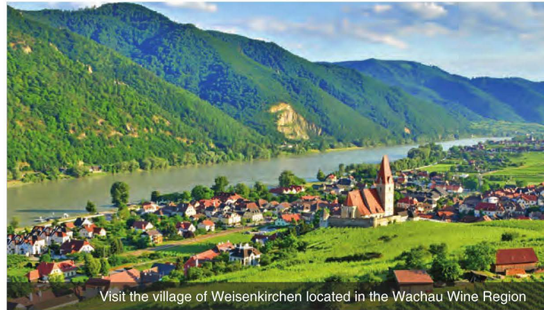
Visit the village of Weissenkirchen located in the Wachau Wine Region

DAY 1 Depart the USA: Depart the USA on your overnight flight to Prague, Czech Republic.