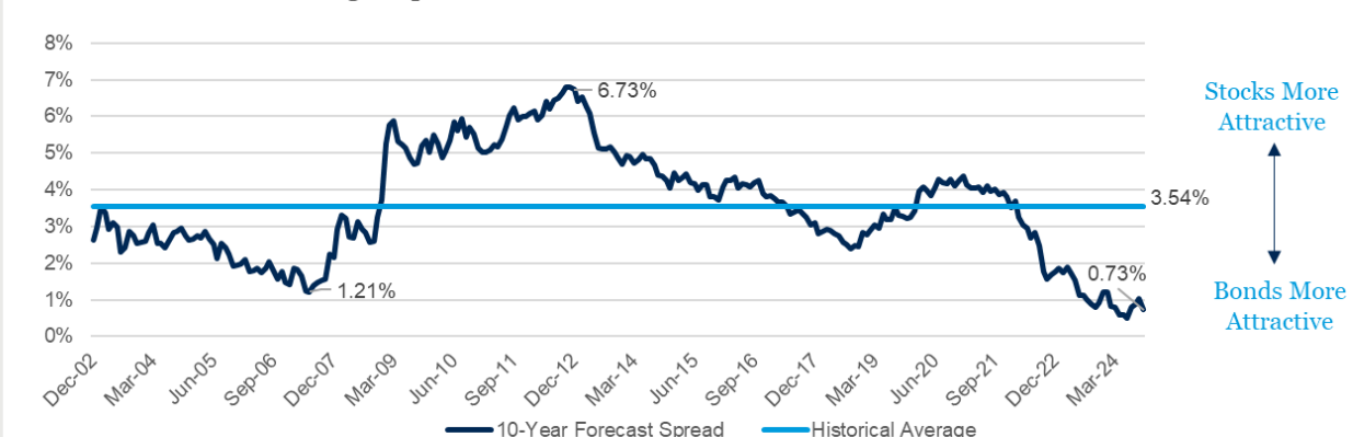
10-Year Forecast of U.S. Large Cap vs Core Bonds

The graphic illustrates the difference in our forward-looking 10-year return assumptions for U.S. large-cap stocks and U.S. core bonds. A wider spread signals a more compelling case for equities over bonds. Conversely, a narrower spread suggests less incentive to take on equity risk without adequate compensation. Our 2025 10-year outlook has the spread at just 0.73%. Aside from recent months at similar levels, the last time the gap between equity and fixed income returns was this narrow was in the summer of 2007.