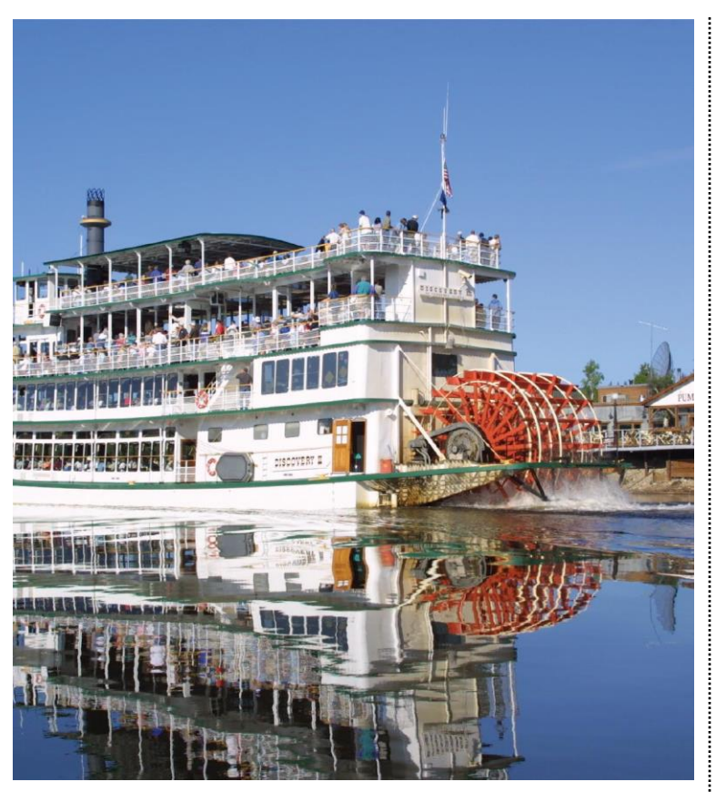
12 Days 26 Meals : 11 Breakfasts, 7 Lunches, 8 Dinners

HIGHLIGHTS... Fairbanks, Sternwheeler Discovery, Fannie Q's Saloon, Denali National Park, Tundra Wilderness Tour, Luxury Domed Rail, Anchorage, Hubbard Glacier, Glacier Bay, Skagway, Juneau, Ketchikan, Inside Passage